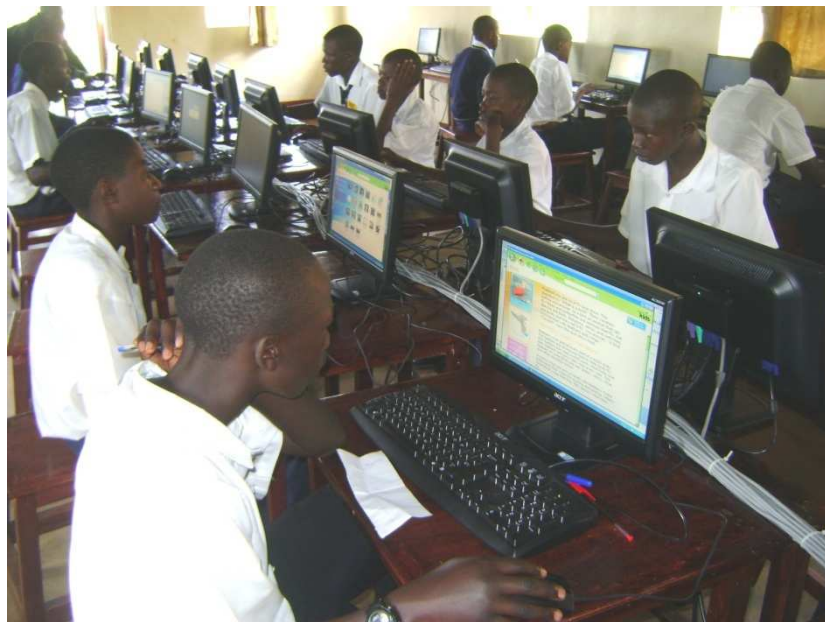
A typical ICT laboratory at Mukono High School, Mukono district

The Ministry of Education and Sports has the oversight role for the school ICT laboratories and all their activities.