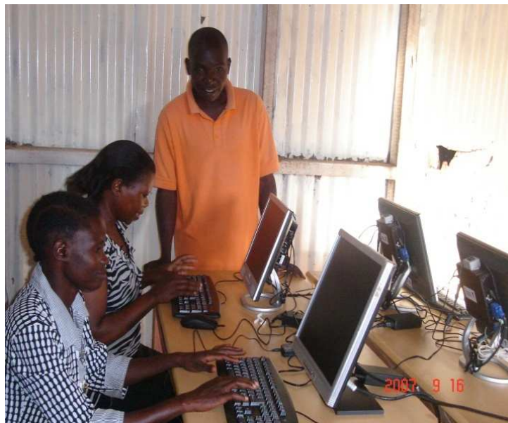
A typical ICT training centre/Internet café in Amuria town, Amuria district

Like all other projects of RCDF, the facilities are established as partnerships between UCC and a private or public partner.