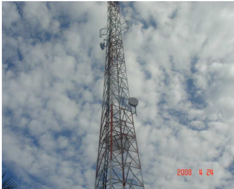
A typical POP in Tororo town

Through a competitive bidding process, the Uganda Telecom Ltd won the tender for subsidy to set up POP in the district.