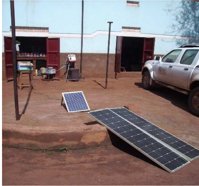
A typical public pay phone in Oyarotonge village, Pader village