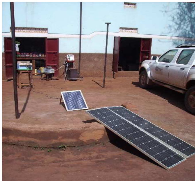
A typical public pay phone in Oyarotonge village, Pader village

A detailed list showing locations of public pay phones in the district is shown in the Annex.