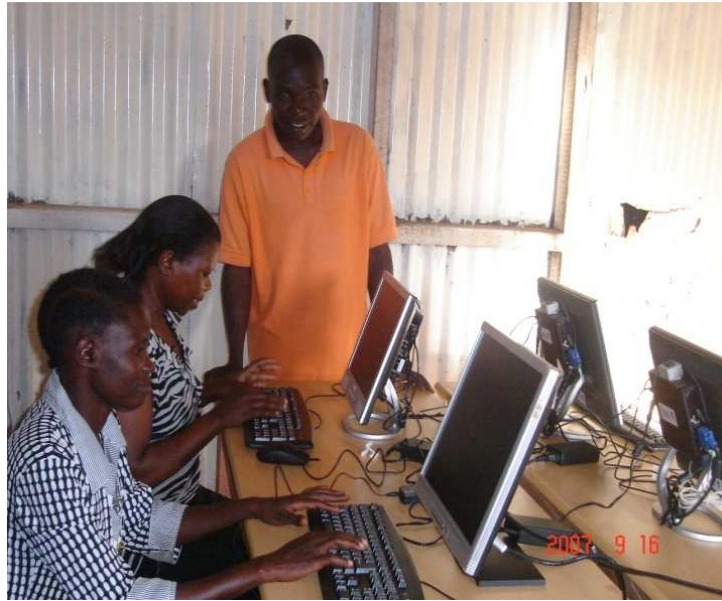
An ICT training centre/Internet café in Amuria town, Amuria district

Like all other projects of RCDF, the facilities are established as partnerships between UCC and a private or public partner.