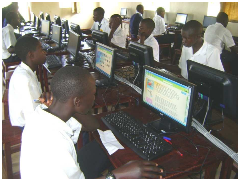
An ICT laboratory at Mukono High School, Mukono district

The Ministry of Education and Sports has the oversight role for the school ICT laboratories and all their activities.