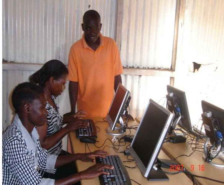
A typical ICT training centre/Internet café in Amuria town, Amuria district

The ICT training centre/Internet café is made up of a minimum of 5 computers that are all connected to the internet. Services provided at the ICT training centre/Internet café are paid for at market competitive rates for the area. Other people in several other districts have replicated the internet cafes/ICT training centres and offer similar or better services. A user may therefore need to compare the services in all the cafes in the area for a better deal.